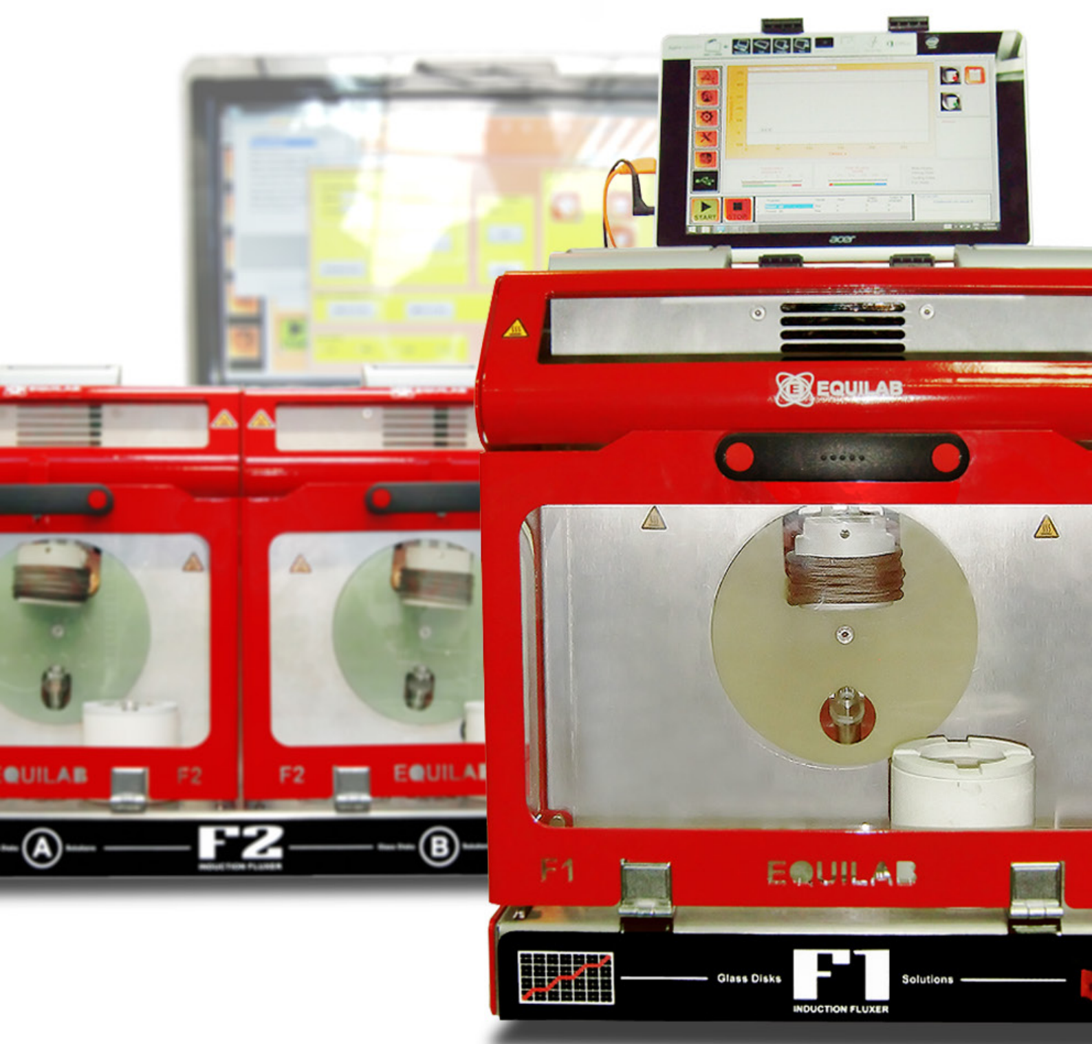
F Series Induction Fluxers